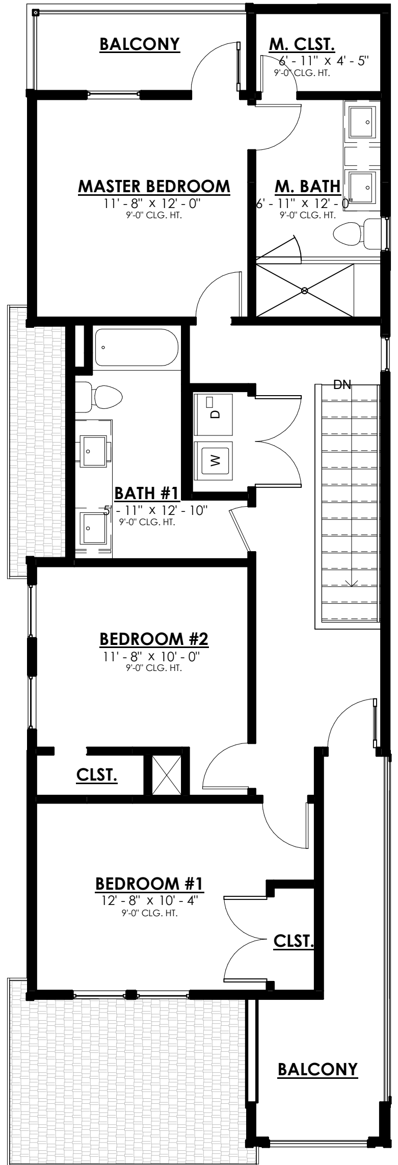
② 2ND FLOOR 3/16" = 1'-0"